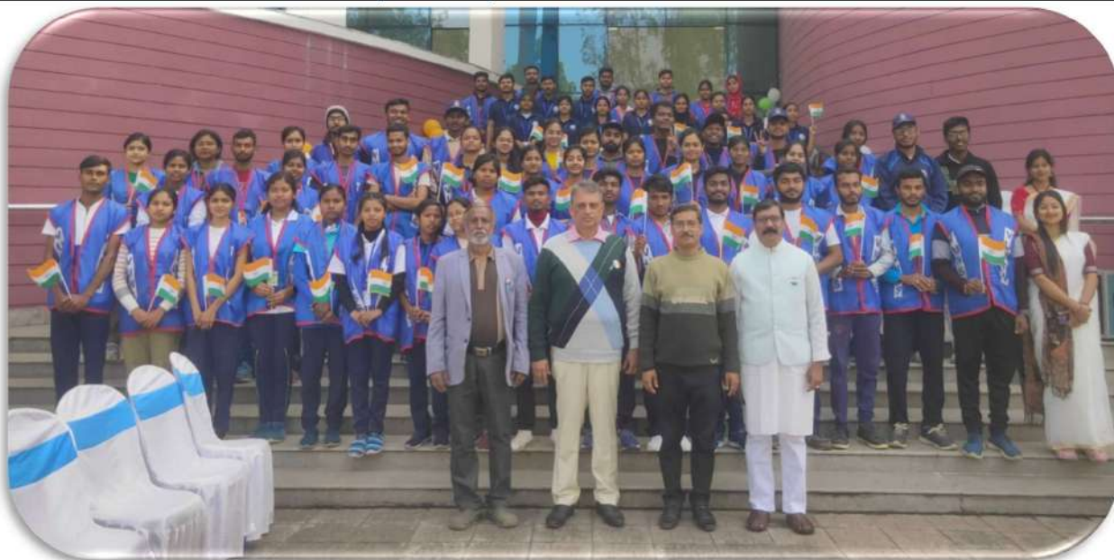
Republic Day Celebration on 26 th January, 2025