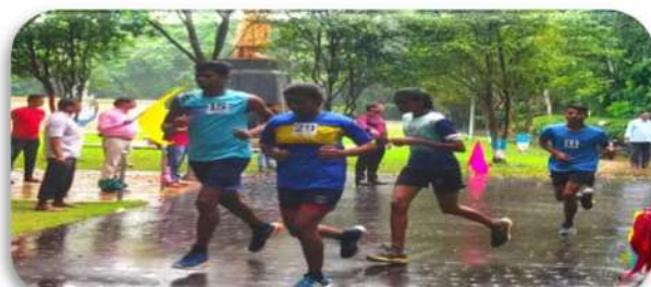
Red Run Marathon on 23.08.24