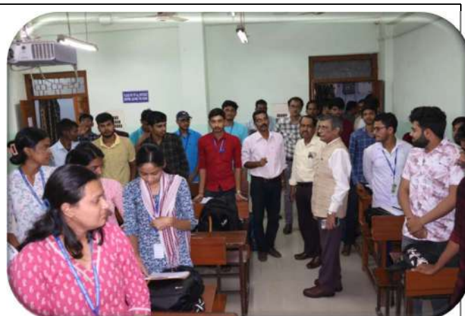
Hon'ble Vice-Chancellor's visit to Dept. of Physics, 04.03.2025