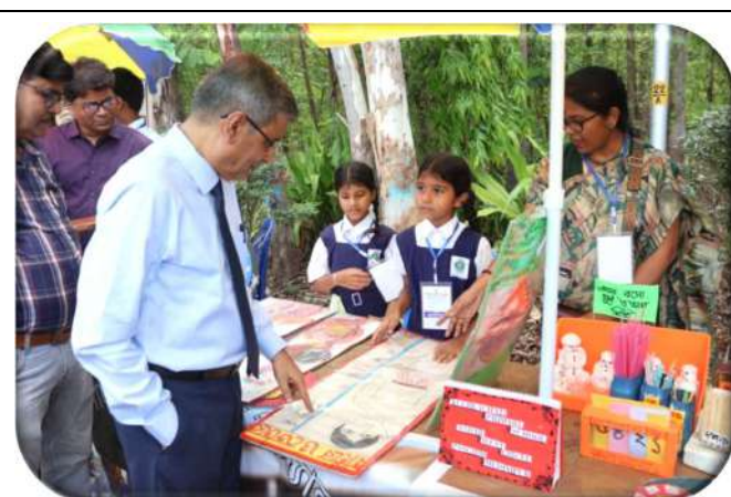
Tech Fest at Vidyasagar University, 28.05.2025