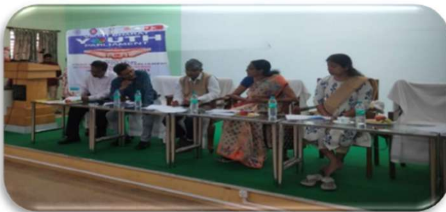
Youth Parliament Competition at Vidyasagar University on 20.03.2025 and 21.03.2025