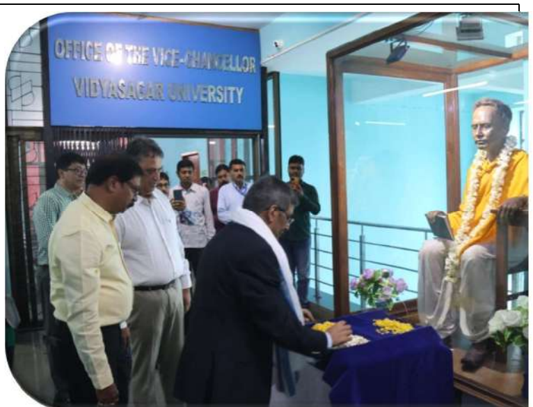
Hon'ble Vice-Chancellor paying homage to Swachandrade Vidyasagar, 19.03.2025