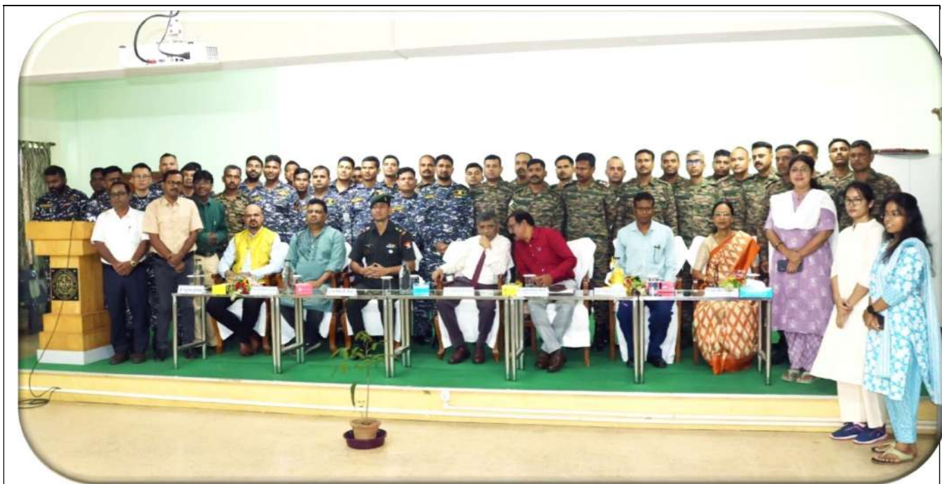
Session on Military Training at Vidyasagar University, 03.06.2025