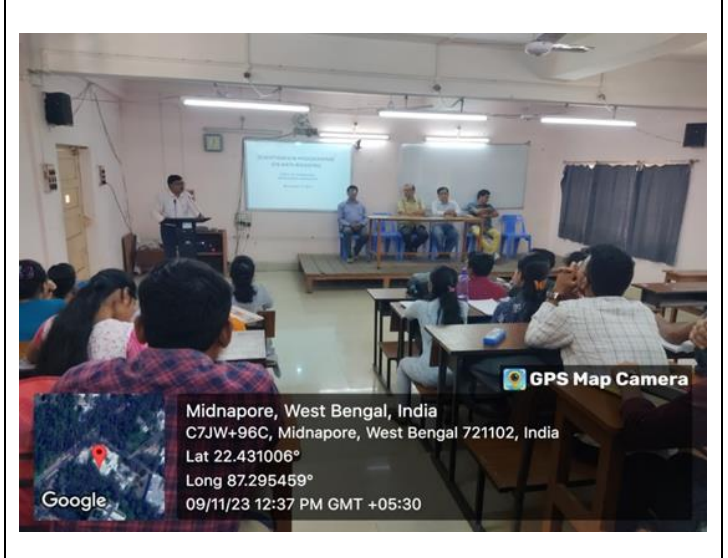
Figure 14: Sensitization programme on Anti-ragging at various departments