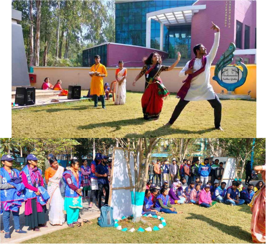
Youth Day programme on 12th January, 2024