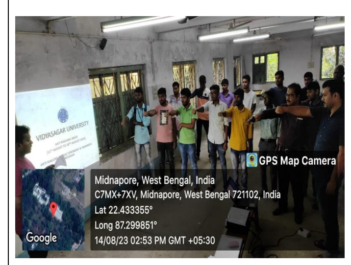
Figure 9: Oath taking by the PG Boy's hostel during Antiragging week celebrations

University organized Anti-ragging week (12-18 August 2023) where students of various departments took part in different activities like anti-ragging poster making, anti-ragging slogan writing, essay competition on various aspects and menace of ragging, oath taking etc. (Figure 9, 10 and 11).