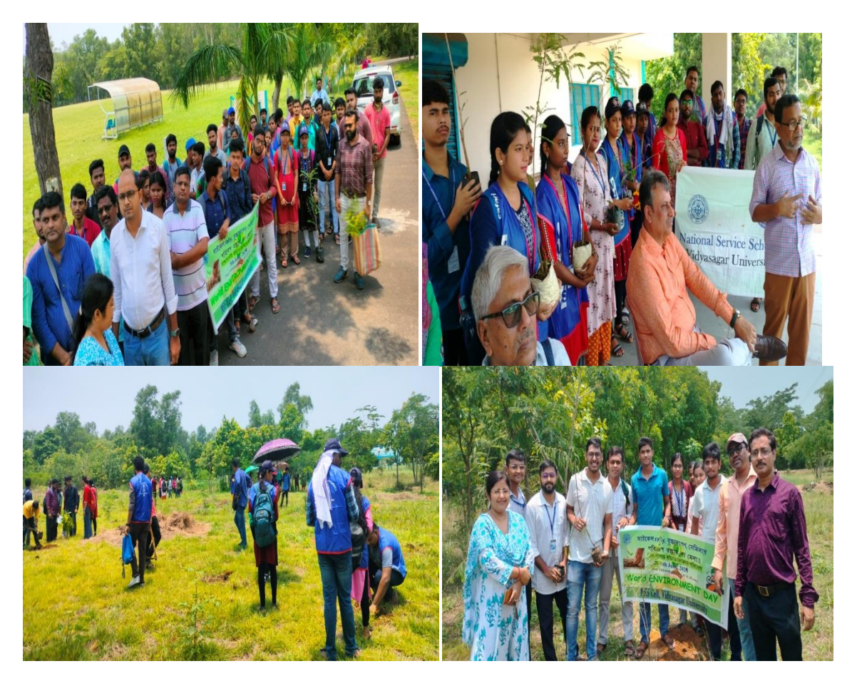
Programme on World Environment Day celebration on 5<sup>th</sup> June, 2024.