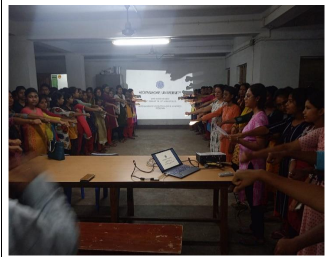
Figure 10: Oath taking during Anti-ragging week celebrations