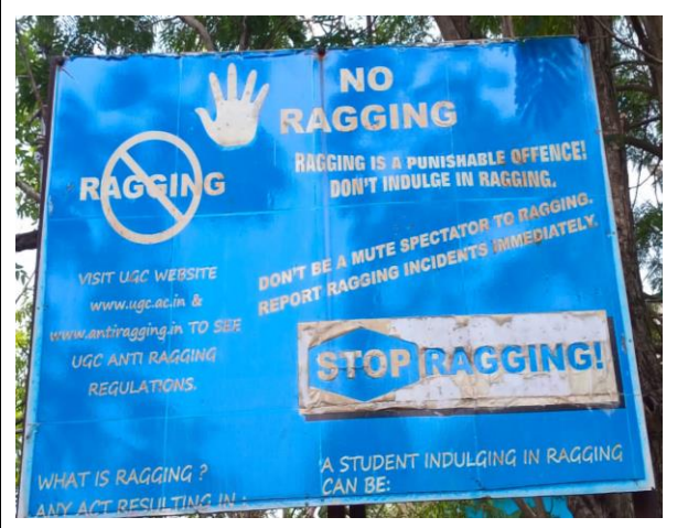
Figure 4: Anti-ragging Awareness Poster placed at different locations in the Vidyasagar University Campus

Leaflets are prepared and distributed among the newly admitted students informing them about the name and address of the nodal officer, that of members of anti-ragging committee and squad, mobile number of UGC Monitoring agency, email address of the UGC anti-ragging helpline etc.