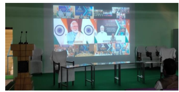
Biksit Bharat 2047 programme at Vidyasagar University