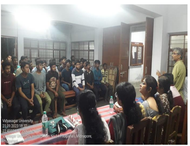
Figure 6: Members of Anti-ragging squad and Chairman of Anti-ragging committee regularly visit the students' hostels and make students aware of the menace of ragging.