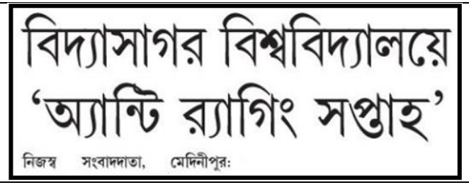
Figure 11: Media Coverage of Anti-ragging Week celebration at Vidyasagar University