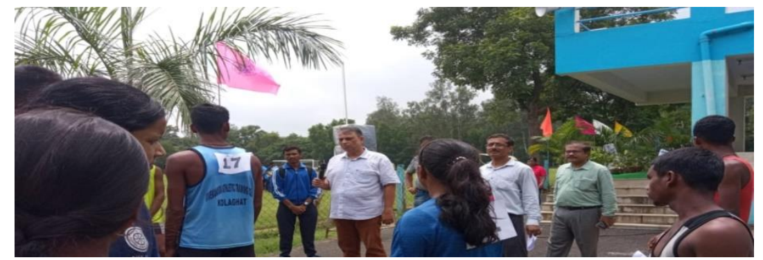
Red Run Marathon on 8th June, 2023