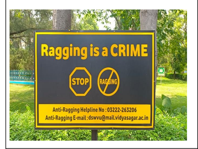
Figure 3: Anti-ragging Awareness Poster placed at different locations in the Vidyasagar University Campus