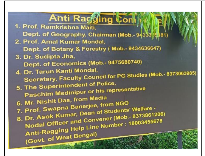
Figure 1: Name and contact numbers of Anti-Ragging Committee members displayed at prominent locations in the Vidyasagar University campus

University steps up anti-ragging mechanism by installing CCTV cameras in the entire campus including the residential premises. University boosts publicity of anti-ragging measures by direct interaction through awareness lectures, displaying anti-ragging posters (available UGC website) in prominent locations of every academic department, central library, canteens, students' hostels etc. Anti-ragging regulations of UGC, and the measured taken by the University including the names and contact details of anti-ragging committee and anti-ragging squad members are published in e-prospectus as well as University Website.