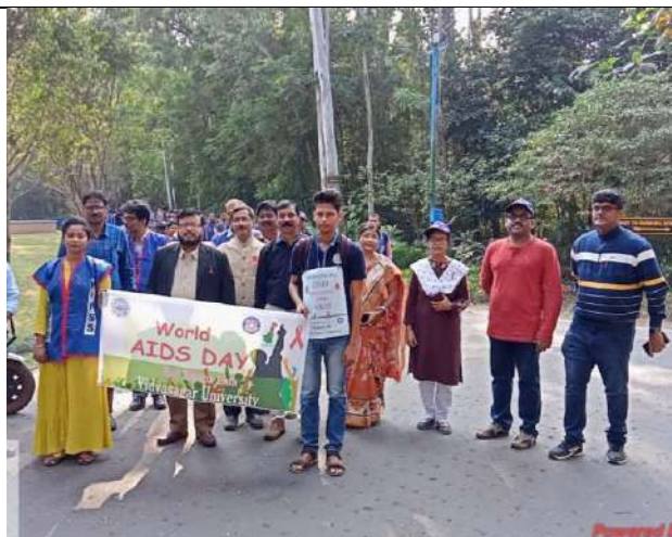
Celebration of World AIDS Day 01.12.2022