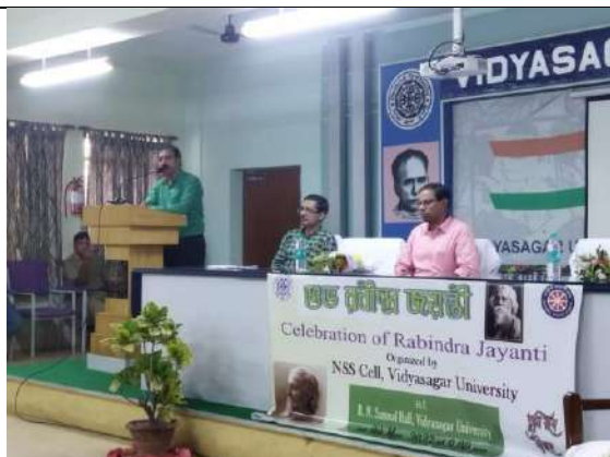
Celebration of Rabindra Jayanti, 2023