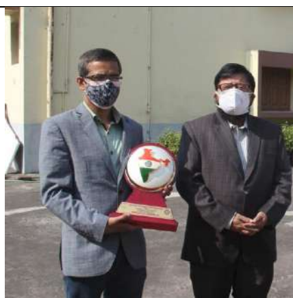
State NSS award for best activity for 2018-2019 was received by Hon'ble Vice Chancellor and Programme Coordinator on 6 th January, 2022