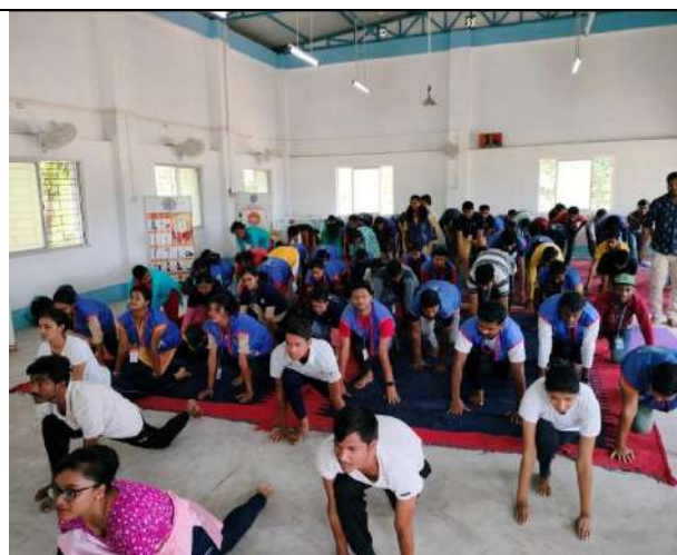
International Yoga day celebration on 21 st June, 2023