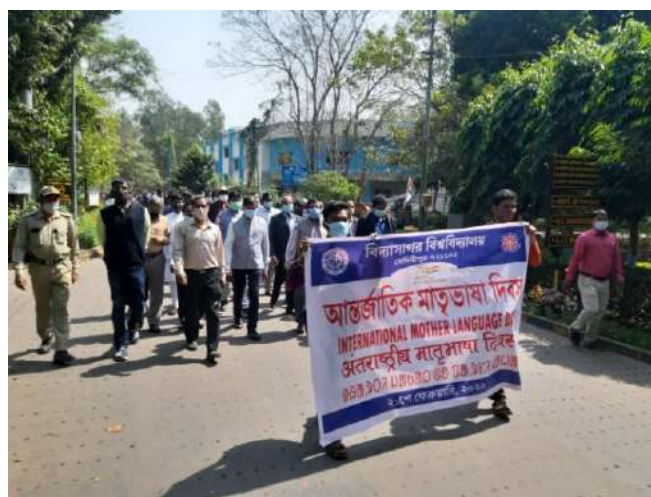
Programme on International Mother language day