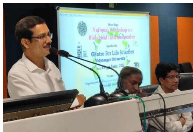
National Workshop on Biological Instrumentation in June 2022