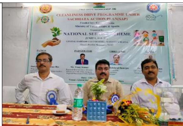
Cycle rally and Swachhata Action Plan to aware about different environmental issues