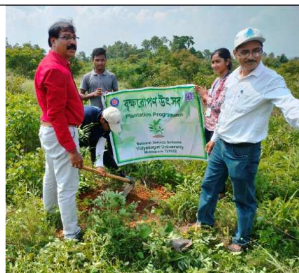
Programme on World Environment Day celebration on 5 th June, 2023.