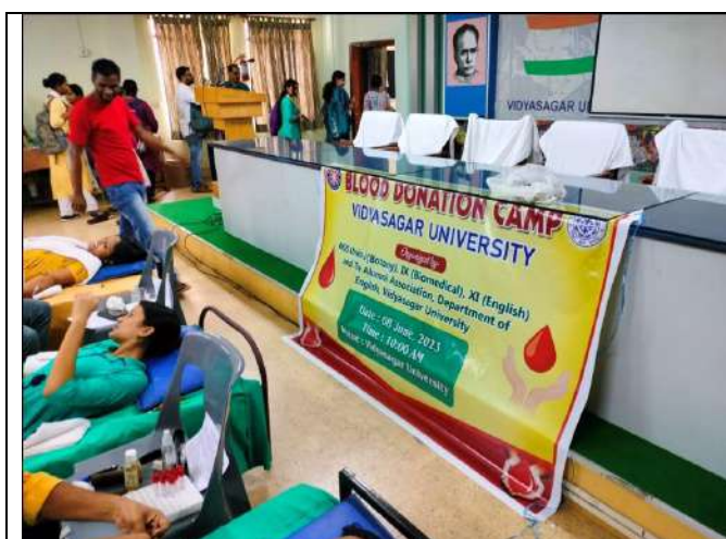
Blood donation programme