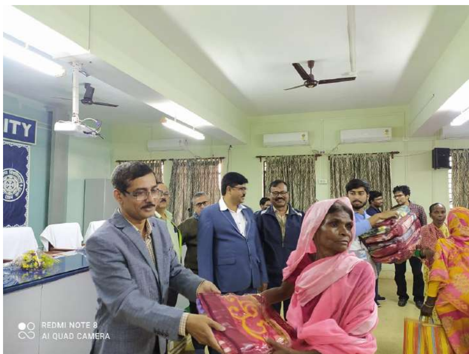
Blanket distribution to the people of adopted Villages in December, 2022