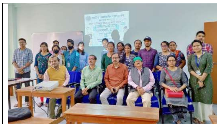
National Science Day programme organized by the CLS

The centre now regularly organizes short term training courses in different branches of life sciences.