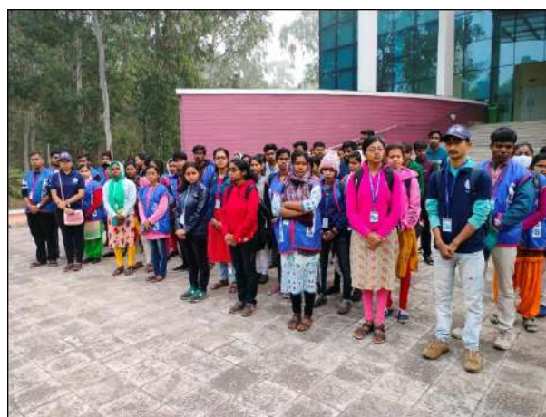
Republic Day Celebration on 26.01.2023 at Vidyasagar University Campus