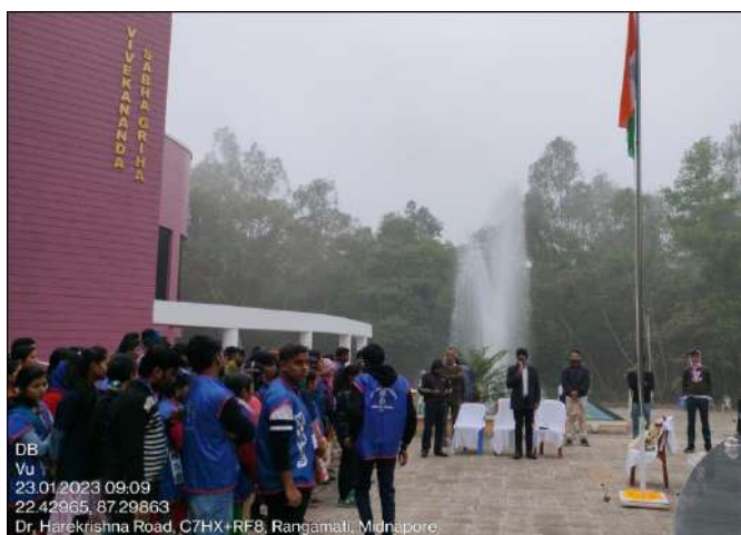
Celebration of Netaji Birth Day on 23 January, 2023